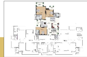
Type H apartments feature 3 bedrooms (including a master bedroom), a spaciouly sprawling combined living and dining room area, a commodious kitchen, 4 balconies, a powder room and a domestic help room.