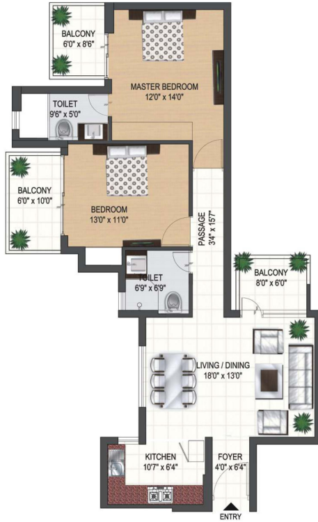
Type E apartments consist of a lobby, an expansive combined living room and dining area, 2 bedrooms (including a master bedroom), a commodious kitchen and 3 balconies.